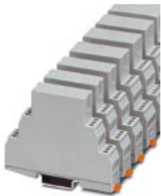
Electronic housing for installation distributors, double-level, for insertion of a p.c.b.

Please be informed that the data shown in this PDF Document is generated from our Online Catalog. Please find the complete data in the user's documentation. Our General Terms of Use for Downloads are valid ( http://download.phoenixcontact.com )