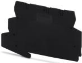
Illustration shows the black product version

End cover for TERMITRAB TT-ST-..., width: 2.2 mm, color: Blue