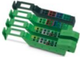
Connector set for Inline bus coupler, color-coded

Please be informed that the data shown in this PDF Document is generated from our Online Catalog. Please find the complete data in the user's documentation. Our General Terms of Use for Downloads are valid ( http://phoenixcontact.com/download )