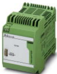
Energy storage device, lead AGM, VRLA technology, 12 V DC, 1.6 Ah.

Please be informed that the data shown in this PDF Document is generated from our Online Catalog. Please find the complete data in the user's documentation. Our General Terms of Use for Downloads are valid ( http://phoenixcontact.com/download )