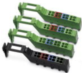
Connector set, for Inline bus coupler with I/Os mounted in rows

Please be informed that the data shown in this PDF Document is generated from our Online Catalog. Please find the complete data in the user's documentation. Our General Terms of Use for Downloads are valid ( http://phoenixcontact.com/download )