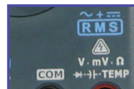
Square Wave Output (2890A only)