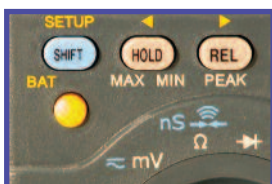
Easy to Understand Interface