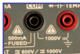
IEC Rated Inputs