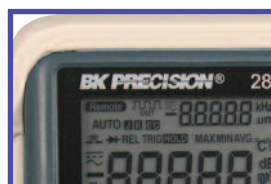
Back Lit LCD (2890A only)