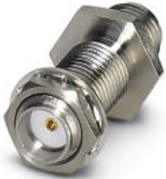
Antenna adapter for control cabinet feed-through, frequency range: 0.3 GHz ... 6 GHz, connection: 2 x SMA (female)

Please be informed that the data shown in this PDF Document is generated from our Online Catalog. Please find the complete data in the user's documentation. Our General Terms of Use for Downloads are valid ( http://phoenixcontact.com/download )