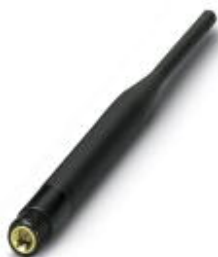
Omnidirectional antenna, 900 MHz, gain: 2 dBi, polarization: linear, degree of protection: IP55, connection: RSMA (male)

Please be informed that the data shown in this PDF Document is generated from our Online Catalog. Please find the complete data in the user's documentation. Our General Terms of Use for Downloads are valid ( http://phoenixcontact.com/download )