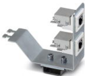
Patch field with two RJ45 CAT6 network connections

Please be informed that the data shown in this PDF Document is generated from our Online Catalog. Please find the complete data in the user's documentation. Our General Terms of Use for Downloads are valid ( http://phoenixcontact.com/download )