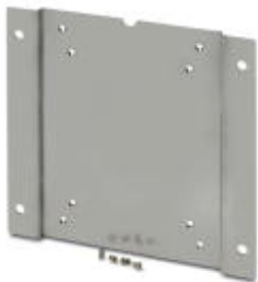
Mounting plate for FL SWITCH 30... and FL SWITCH 40... 16-port switches

Please be informed that the data shown in this PDF Document is generated from our Online Catalog. Please find the complete data in the user's documentation. Our General Terms of Use for Downloads are valid ( http://phoenixcontact.com/download )