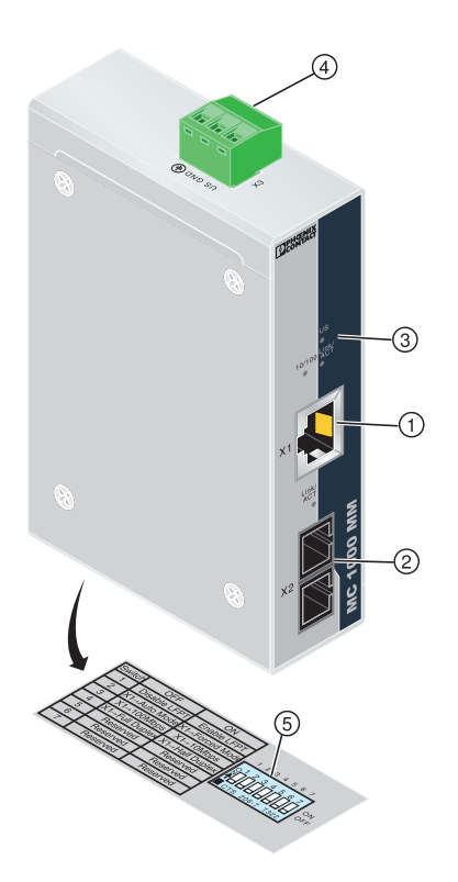
Figure 2 Connectors and LEDs