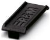
Color marking for FL PATCH GUARD, black

Color-coding - FL PATCH GUARD CCODE BK - 2891136