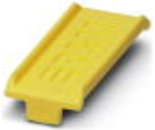
Color marking for FL PATCH GUARD, yellow

Color-coding - FL PATCH GUARD CCODE YE - 2891437