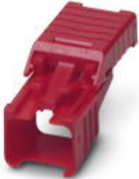
Lockable security element

Please be informed that the data shown in this PDF Document is generated from our Online Catalog. Please find the complete data in the user's documentation. Our General Terms of Use for Downloads are valid ( http://download.phoenixcontact.com )