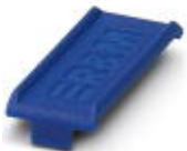
Color marking for FL PATCH GUARD, blue

Color-coding - FL PATCH GUARD CCODE BU - 2891233