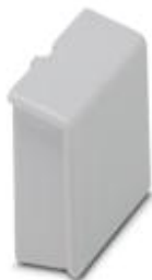
Component housing, Filler plug; 35.6, color: light gray

Please be informed that the data shown in this PDF Document is generated from our Online Catalog. Please find the complete data in the user's documentation. Our General Terms of Use for Downloads are valid ( http://phoenixcontact.com/download )