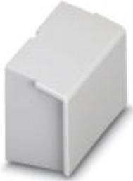
Keying tab 53.6 mm

Please be informed that the data shown in this PDF Document is generated from our Online Catalog. Please find the complete data in the user's documentation. Our General Terms of Use for Downloads are valid ( http://download.phoenixcontact.com )