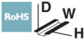
Figure shows PLC-BSC-120UC/21-21/SO46 version

14 mm PLC basic terminal block with push-in connection, without relay or solid-state relay, for mounting on DIN rail NS 35/7,5, 2 PDTs, input voltage 12 V DC