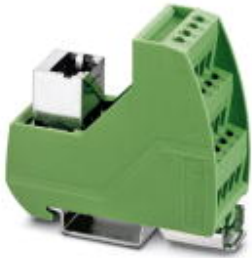
VARIOFACE module with screw connection and RJ45 connector

Please be informed that the data shown in this PDF Document is generated from our Online Catalog. Please find the complete data in the user's documentation. Our General Terms of Use for Downloads are valid ( http://phoenixcontact.com/download )