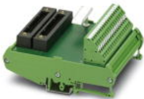
The figure shows the version with spring-cage connection

Please be informed that the data shown in this PDF Document is generated from our Online Catalog. Please find the complete data in the user's documentation. Our General Terms of Use for Downloads are valid ( http://phoenixcontact.com/download )