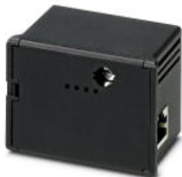
Ethernet communication module for the EEM-MA600 with integrated web server

Please be informed that the data shown in this PDF Document is generated from our Online Catalog. Please find the complete data in the user's documentation. Our General Terms of Use for Downloads are valid ( http://phoenixcontact.com/download )