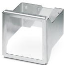
DIN rail adapter for EEM-MA600 and EEM-MA400 energy meters

Please be informed that the data shown in this PDF Document is generated from our Online Catalog. Please find the complete data in the user's documentation. Our General Terms of Use for Downloads are valid ( http://phoenixcontact.com/download )