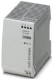
Primary-switched UNO POWER power supply for DIN rail mounting, input: 1-phase, output: 15 V DC/100 W

Please be informed that the data shown in this PDF Document is generated from our Online Catalog. Please find the complete data in the user's documentation. Our General Terms of Use for Downloads are valid ( http://phoenixcontact.com/download )