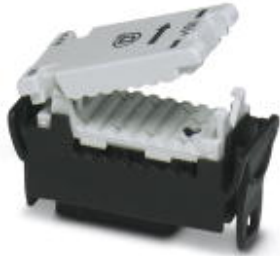
SmartWire DT™ device plug, 8-pos.

Please be informed that the data shown in this PDF Document is generated from our Online Catalog. Please find the complete data in the user's documentation. Our General Terms of Use for Downloads are valid ( http://phoenixcontact.com/download )