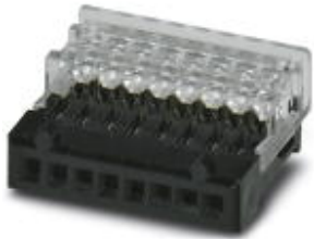
SmartWire DT™ flat plug, 8-pos.

Please be informed that the data shown in this PDF Document is generated from our Online Catalog. Please find the complete data in the user's documentation. Our General Terms of Use for Downloads are valid ( http://phoenixcontact.com/download )