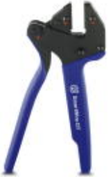
SmartWire DT™ pliers for device plugs

Please be informed that the data shown in this PDF Document is generated from our Online Catalog. Please find the complete data in the user's documentation. Our General Terms of Use for Downloads are valid ( http://phoenixcontact.com/download )