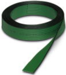
SmartWire DT™ 100 m flat-ribbon conductor, 8-pos.

Please be informed that the data shown in this PDF Document is generated from our Online Catalog. Please find the complete data in the user's documentation. Our General Terms of Use for Downloads are valid ( http://phoenixcontact.com/download )