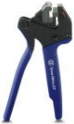
SmartWire DT™ pliers for flat plug

Please be informed that the data shown in this PDF Document is generated from our Online Catalog. Please find the complete data in the user's documentation. Our General Terms of Use for Downloads are valid ( http://phoenixcontact.com/download )