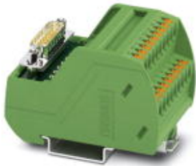
The illustration shows a 15-position version

Please be informed that the data shown in this PDF Document is generated from our Online Catalog. Please find the complete data in the user's documentation. Our General Terms of Use for Downloads are valid ( http://download.phoenixcontact.com )