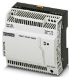
DIN rail power supply unit 24 V DC/3.5 A, primary switched-mode, 1-phase.

Please be informed that the data shown in this PDF Document is generated from our Online Catalog. Please find the complete data in the user's documentation. Our General Terms of Use for Downloads are valid ( http://phoenixcontact.com/download )