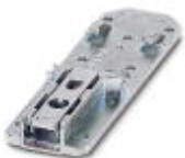
Universal DIN rail adapter