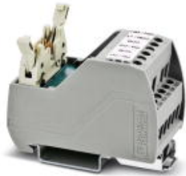
VARIOfACE Professional (VIP) board for the ROC800 controller

Please be informed that the data shown in this PDF Document is generated from our Online Catalog. Please find the complete data in the user's documentation. Our General Terms of Use for Downloads are valid ( http://phoenixcontact.com/download )