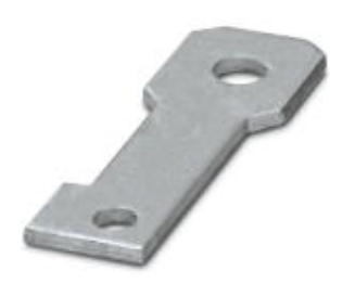
Plate for fixing the FLT-ISG-100-EX isolating spark gap to a flange, drill hole diameter of 14 mm.

Please be informed that the data shown in this PDF Document is generated from our Online Catalog. Please find the complete data in the user's documentation. Our General Terms of Use for Downloads are valid (http://phoenixcontact.com/download)