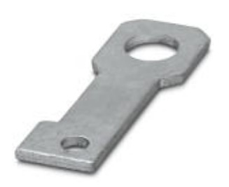
Plate for fixing the FLT-ISG-100-EX isolating spark gap to a flange, drill hole diameter of 22 mm.

Please be informed that the data shown in this PDF Document is generated from our Online Catalog. Please find the complete data in the user's documentation. Our General Terms of Use for Downloads are valid (http://phoenixcontact.com/download)