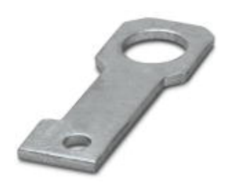
Plate for fixing the FLT-ISG-100-EX isolating spark gap to a flange, drill hole diameter of 26 mm.

Please be informed that the data shown in this PDF Document is generated from our Online Catalog. Please find the complete data in the user's documentation. Our General Terms of Use for Downloads are valid (http://phoenixcontact.com/download)