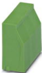
Filler plugs, for unoccupied terminal points

Please be informed that the data shown in this PDF Document is generated from our Online Catalog. Please find the complete data in the user's documentation. Our General Terms of Use for Downloads are valid ( http://phoenixcontact.com/download )