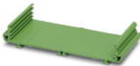
The illustration shows the variant UM 45-Profil CM

Drawn section panel mounting base, with a constructional width of 108 mm and a fixed length of 100 cm