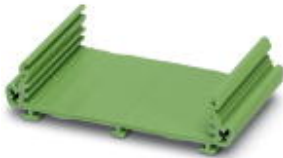
The illustration shows the variant UM 45-Profil CM

Drawn section panel mounting base, with a constructional width of 72 mm and a fixed length of 100 cm