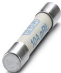
Fuse, nominal current: 10 A, length: 31.8 mm, diameter: 6.35 mm

Please be informed that the data shown in this PDF Document is generated from our Online Catalog. Please find the complete data in the user's documentation. Our General Terms of Use for Downloads are valid ( http://phoenixcontact.com/download )