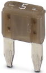
Fuse, nominal current: 5 A, length: 11.9 mm, width: 3.8 mm, height: 16.2 mm

Please be informed that the data shown in this PDF Document is generated from our Online Catalog. Please find the complete data in the user's documentation. Our General Terms of Use for Downloads are valid ( http://phoenixcontact.com/download )