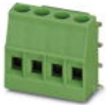
PCB terminal block, Nominal current: 24 A, Nom. voltage: 400 V, Pitch: 5 mm, Number of positions: 4, Connection method: Screw connection, Mounting: Soldering, Conductor/PCB connection direction: 0 °, Color: green, Article with lateral pin exit

Basic terminal block - MKDSO 2,5/ 4-R - 1707247