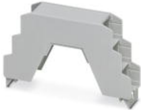
Upper part of housing, for COMBICON connection, three-level

Please be informed that the data shown in this PDF Document is generated from our Online Catalog. Please find the complete data in the user's documentation. Our General Terms of Use for Downloads are valid ( http://download.phoenixcontact.com )