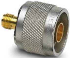
Antenna adapter, frequency range: 0.3 GHz ... 6 GHz, connection: N (male) -> SMA (female)

Please be informed that the data shown in this PDF Document is generated from our Online Catalog. Please find the complete data in the user's documentation. Our General Terms of Use for Downloads are valid ( http://phoenixcontact.com/download )