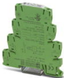
Timer relay with switch-on delay (with control contact) and an adjustable time range (3 s - 300 s), with screw connection

Please be informed that the data shown in this PDF Document is generated from our Online Catalog. Please find the complete data in the user's documentation. Our General Terms of Use for Downloads are valid ( http://phoenixcontact.com/download )