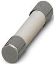
Output fuse (5x20 mm) acc. to IEC 127-2/EN 60127-2, 2 A fast blow

Please be informed that the data shown in this PDF Document is generated from our Online Catalog. Please find the complete data in the user's documentation. Our General Terms of Use for Downloads are valid ( http://phoenixcontact.com/download )