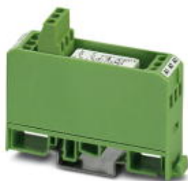
Relay module, with soldered-in miniature switching relay, contact (AgNi): Medium to large loads, 2 PDT, input voltage 24 V AC/DC

Please be informed that the data shown in this PDF Document is generated from our Online Catalog. Please find the complete data in the user's documentation. Our General Terms of Use for Downloads are valid ( http://phoenixcontact.com/download )