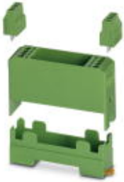
Electronic housing set, consisting of electronic housing and printed circuit termination blocks, pitch 5

Please be informed that the data shown in this PDF Document is generated from our Online Catalog. Please find the complete data in the user's documentation. Our General Terms of Use for Downloads are valid ( http://phoenixcontact.com/download )