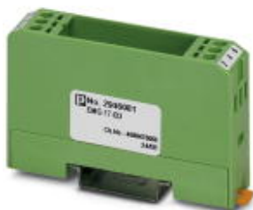
Custom circuit module, consisting of housing, MKDS 3 connection terminal blocks and PCB

Please be informed that the data shown in this PDF Document is generated from our Online Catalog. Please find the complete data in the user's documentation. Our General Terms of Use for Downloads are valid ( http://phoenixcontact.com/download )