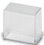
Covering hood, for the contact and dust-protected encapsulation of the components, in transparent design. Height: 35 mm, width: 22.5 mm

Electronic housing - EMG 22-H 52MM GN - 2946175