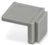
Equipment marker, narrow

Marking material - EMG-SGKS 10 - 2947585