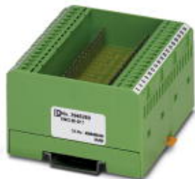
Custom circuit module, consisting of housing, MKDS 3 connection terminal blocks and PCB

Please be informed that the data shown in this PDF Document is generated from our Online Catalog. Please find the complete data in the user's documentation. Our General Terms of Use for Downloads are valid ( http://phoenixcontact.com/download )