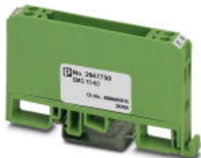
Custom circuit module, consisting of housing, MKDS 3 connection terminal blocks and PCB

Please be informed that the data shown in this PDF Document is generated from our Online Catalog. Please find the complete data in the user's documentation. Our General Terms of Use for Downloads are valid ( http://phoenixcontact.com/download )