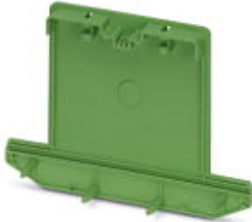
Side element, tall version, for closing both ends of the base element UM-BEFE, for 73 mm wide U-shaped profile cover

Please be informed that the data shown in this PDF Document is generated from our Online Catalog. Please find the complete data in the user's documentation. Our General Terms of Use for Downloads are valid ( http://download.phoenixcontact.com )