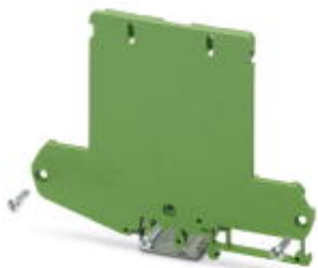
Side element, with foot, tall version, left-hand, for 73 mm wide U-shaped cover.

Please be informed that the data shown in this PDF Document is generated from our Online Catalog. Please find the complete data in the user's documentation. Our General Terms of Use for Downloads are valid ( http://phoenixcontact.com/download )